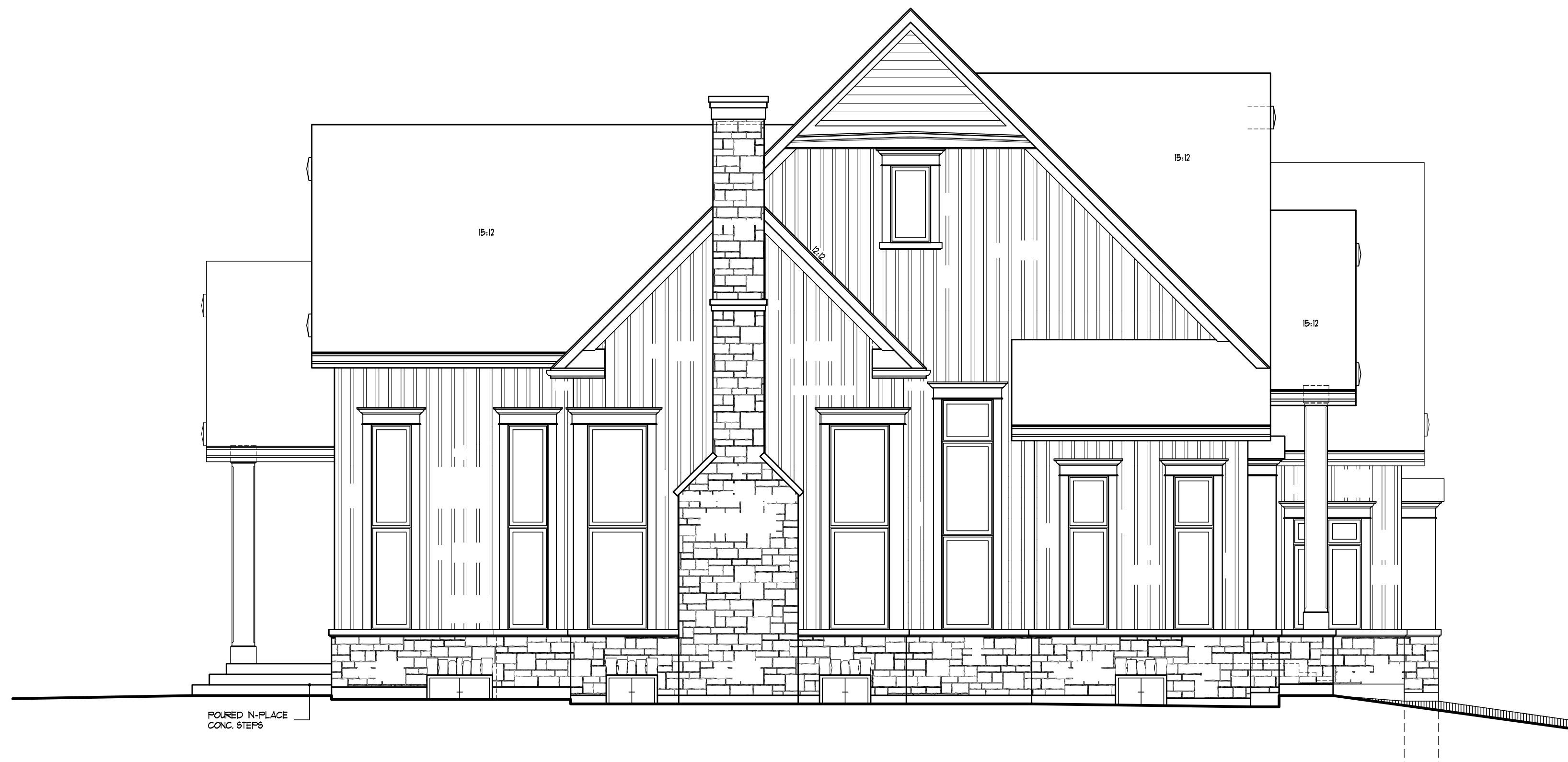
FLANKAGE SIDE ELEVATION